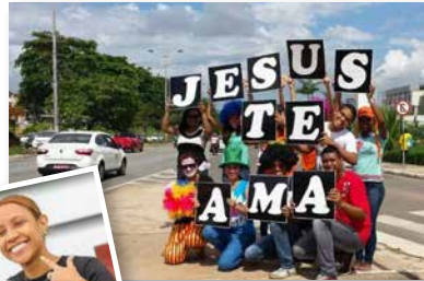
In Brazil 30,000 churches with estimated 3 million Christians actively shared their faith.