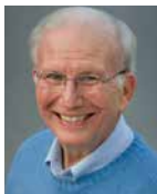
Bishop T.D. Jakes

«The Global Outreach Day is a great way to encourage people to start sharing their faith!»