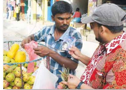
10 million people in Nepal received the Good News, almost all homes were visited!

93% of church members never share the Gospel with others. The Global Outreach Day is a catalyst to mobilize the whole church for evangelism.