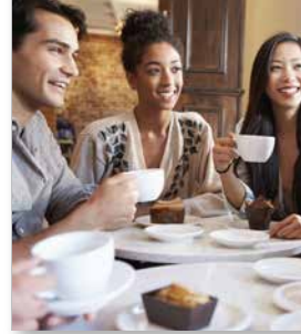
Sharing the Gospel with friends