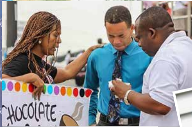
In the Dominican Republic, 2,900 Churches and 250,000 Christians shared the Gospel to 1 million people. As a result 20,000 attended a Bible course.