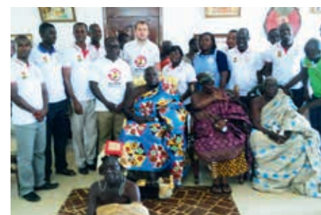
The King of Ghana

Almost 800,000 Christians were actively involved and reached more than two million souls all across Ghana with the Gospel. 741,150 people made a decision for Christ.