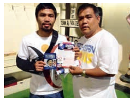
Manny Pacquiao with G.O.D. Tract

Christians were trained in evangelism, and 12,245 people made decisions for Jesus. In one of the largest slum neighborhoods in Manila, many were reached with the Gospel. A lame woman was prayed for, after which she could walk again.