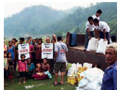
In the Mountains of Nepal

country was a testimony of fruition, unity, and an active and prepared Body of Christ which adopted Global Outreach Day as its own vision.