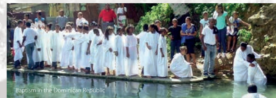
Baptism in the Dominican Republic

She accepted Jesus, was baptized and died shortly thereafter. That was her last chance to make sure she spent eternity with God. One team went to a hospital. The leader was a doctor himself. He reported that three people were healed of Aids.