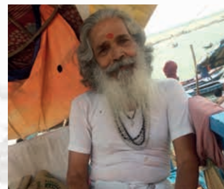
An Indian Guru

A Guru from the highest caste was very open to the message and gave his life to Jesus directly by the Ganges River after he was prayed for.